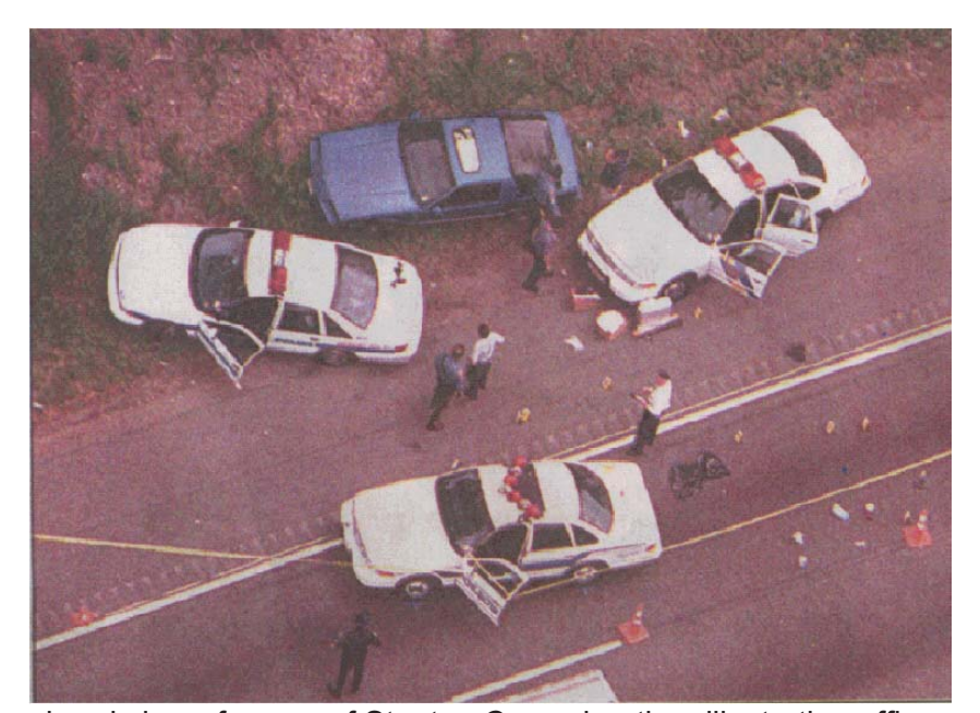
Overhead view of scene of Stanton Crew shooting, illustrating officer crossfire positioning.

• A June 2, 1999 Parsippany, NJ shooting<sup>xiii</sup> involved four officers from three different agencies firing 27 rounds at an unarmed motorist named Stanton Crew. Four of the 27 rounds strike Crew, killing him. One errant round also struck and wounded his unarmed vehicular passenger, Adrienne Hart. As a consequence of the way three police vehicles boxed and forced Crew's vehicle off the road, officers found themselves in a crossfire that contributed to likely confusion about the origin of the initial rounds fired.